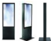
Totems TOT-XXX80H-IR10 TOT-XXX80H-CA10