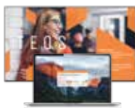
TEOS Connect license TEC-SC100